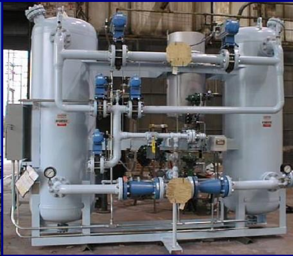
Natural Gas Dryer